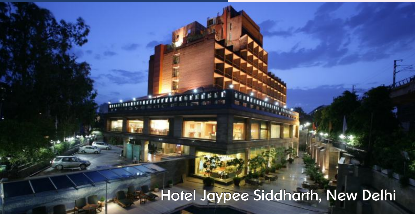
Hotel Jaypee Siddharth, New Delhi